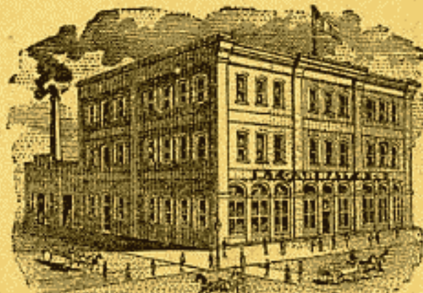
OFFICE & SALESROOM, COR. FREMONT & NATOMA STS.

Water Gates, Gas Gates, Fire Hydrants, Water Meters, Irrigation Valves, Gongs, Steam Gauges, Steam Engine Governors, Pop Safety Valves.