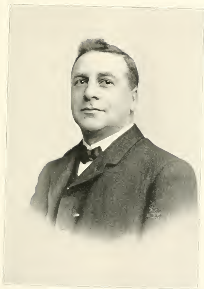
HON. GEORGE SAMUELS