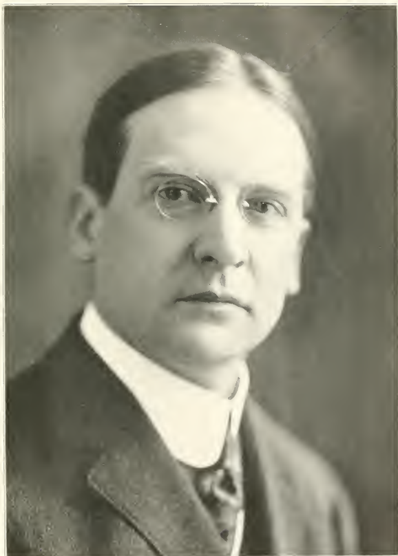
HON. JOSEPH R. KNOWLAND