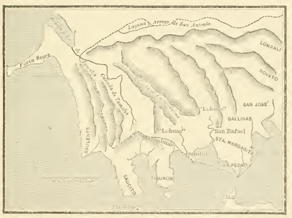
MAP OF S. RAFAEL LANDS IN 1834.

ber of neophytes in 1834 must have been about 500, a decrease of about 50 per cent since 1830; and in 1840 there were 190 Indians living in community with probably 150 scattered. The valuation in 1834 was $18,500, or deducting real estate and church property, $4,500 in excess of debts; two years later the debt seems to have considerably exceeded the available assets, though this fact is somewhat misleading as an indication of the actual state of affairs. A large por-