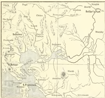
REGION NORTH OF BAY.

a sample of what could be done, so as in the main to avoid bloodshed, could not be effectual unless the enemy were allowed an advantage of five to one; and even then a retreat must be feigned"! Soon it was learned that Todd also had been captured through the treachery of a guide employed to conduct him to the coast. 11 Ford tells us, being confirmed in this particular by Carrillo's testimony already cited, that two