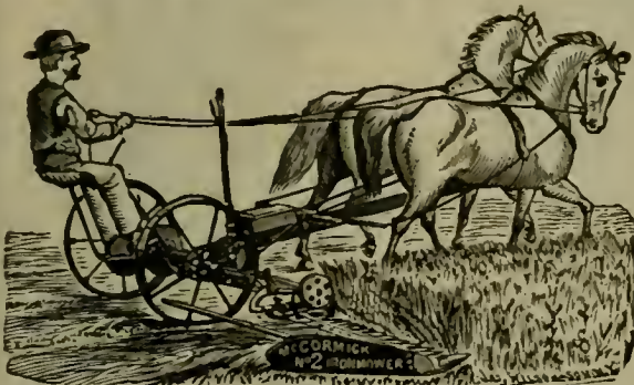
The No. 2 McCormick Mower—The Best in the world.