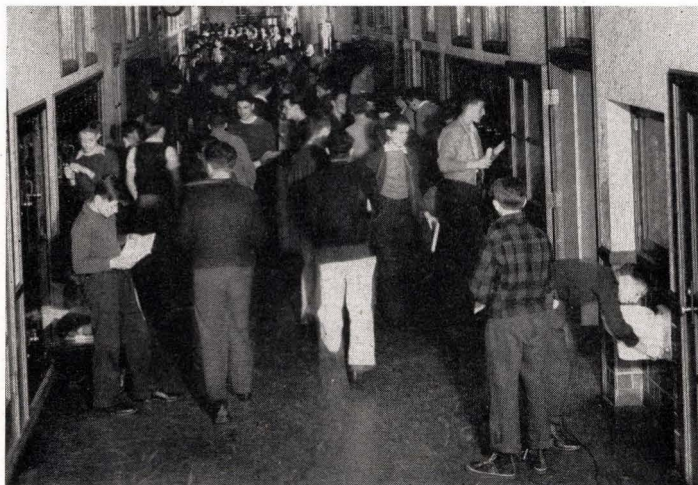
CORRIDOR AT RECESS

Parents' Nights. Early in each semester, a night will be selected and announced when the faculty will be in the classrooms from seven thirty to nine thirty o'clock to receive parents and discuss student progress. It is suggested that parents take advantage of this opportunity to help their sons, especially when report cards indicate that the boy is doing poorly. Parents may call at other times, though these visits will be more satisfactory if arranged by appointment.